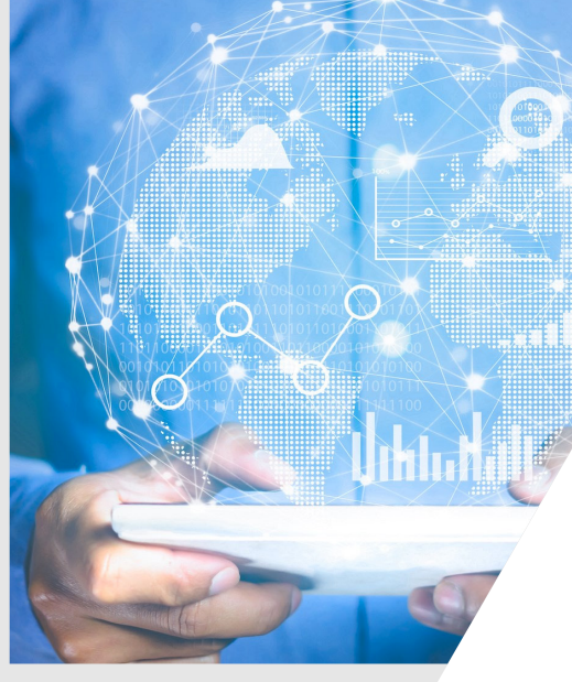
Get A Holistic View of your Market, Optimize your Processes